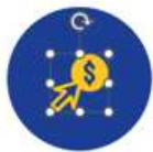
The General Financial Regulation (Regulation 2018/1046),