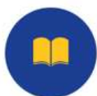
F4E's Financial Regulation