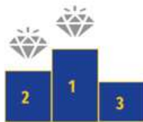
Cascade Multiple FW